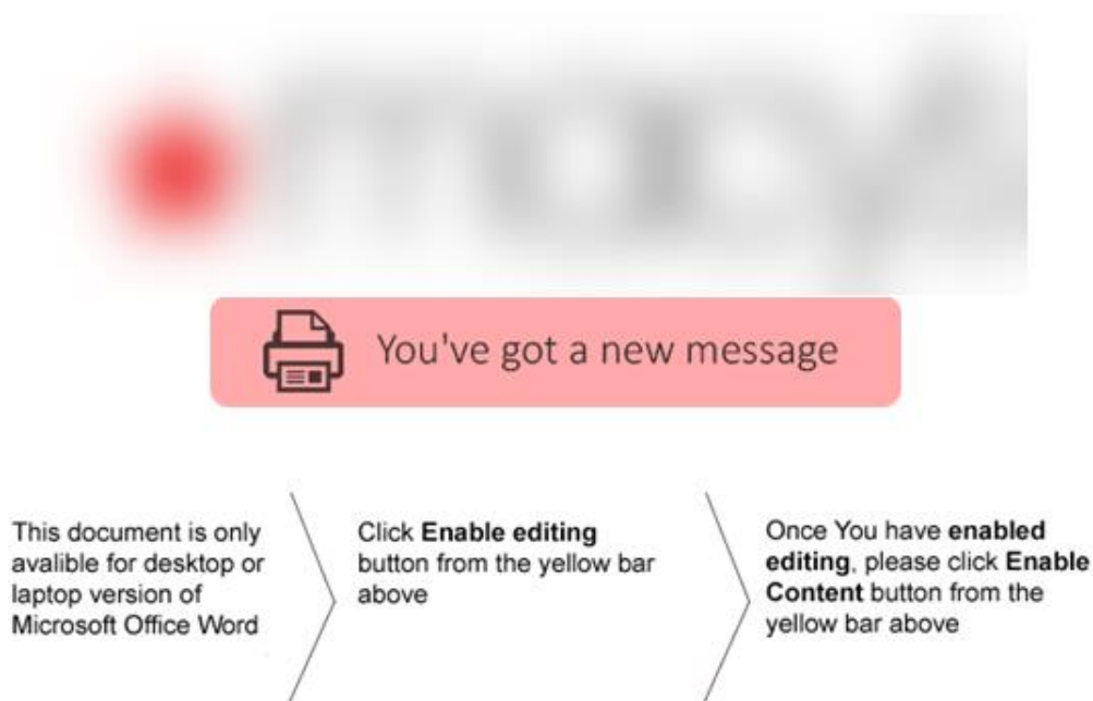
Figure 1 - Phishing Document

The phishing document appears to come from a Ricoh printer and contains the targeted organization logo. The phishing document is a macro enabled document, which executes and downloads 2 nd stage to the victim's machine.