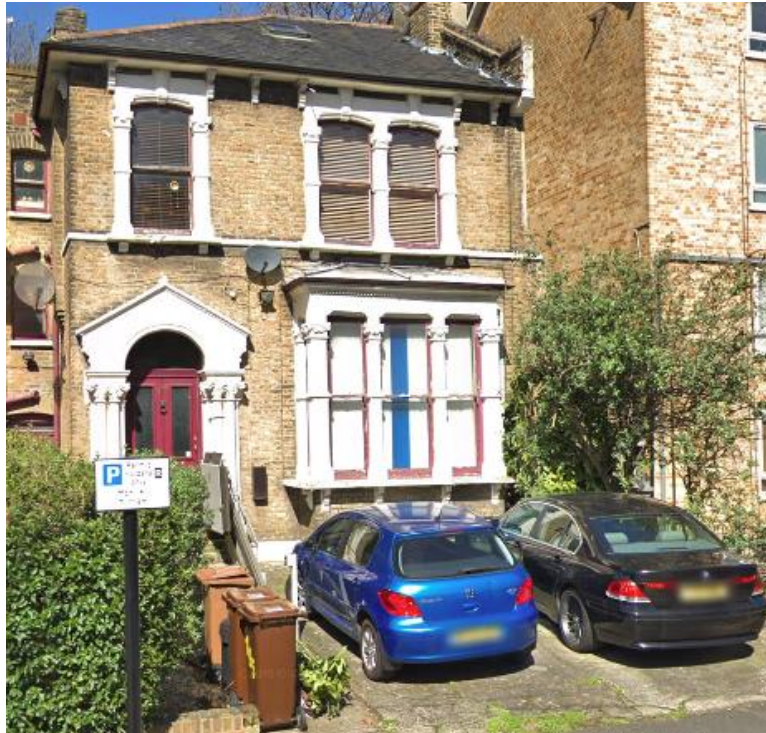
Figure 10 - Neon Crayon Limited registered office location

The fact that NEON CRAYON LIMITED is operated from a private residence may indicate that the company was compromised at some point and had its code signing certificate stolen and used to sign helpobj.dat malware.